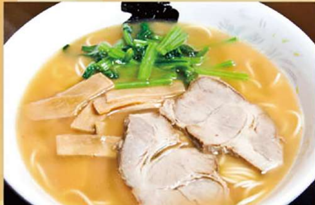
Tonkotsu-Shoyu Ramen $11.00 豚骨醤油らーめん Noodles in pork soy sauce flavoured soup