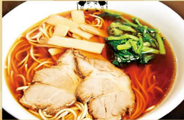
Ramen (Soy Sauce Flavour Soup) $10.50 醤油らーめん Noodles in soy sauce flavoured soup