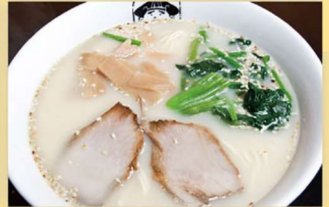
Tonkotsu Ramen (Pork Flavour Soup) $11.00 豚骨らーめん Noodles in pork flavoured soup