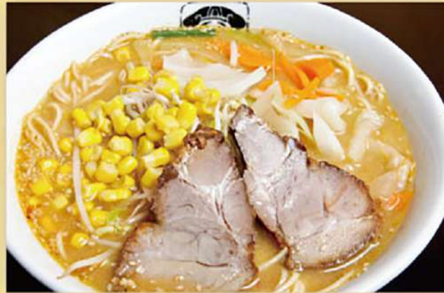
Miso Ramen (Miso Flavour Soup) $13.00 味噌らーめん Noodles with vege and pork mince in miso soup