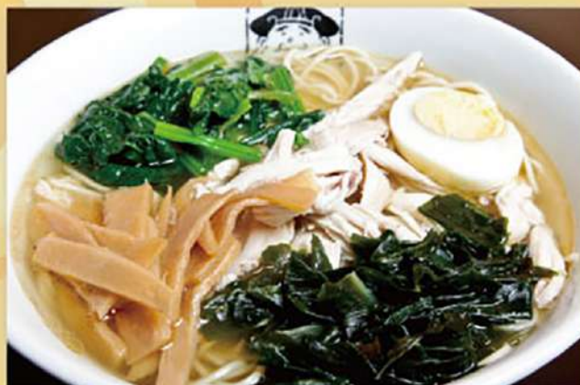
Chicken Ramen $14.00 チキンらーめん Shio Ramen with shredded chicken