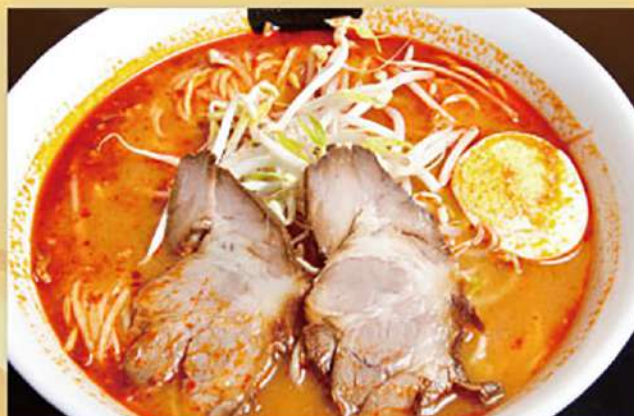
Spicy Miso Tonkotsu $14.00 辛口味噌豚骨らーめん Miso Ramen in spicy tonkotsu soup