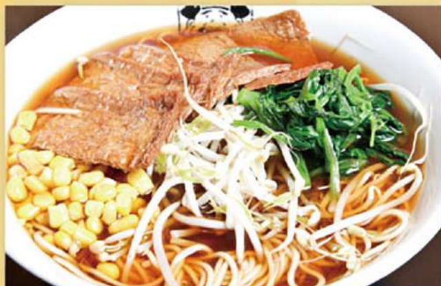
Inari Ramen $12.00 イナリらーめん Ramen with Inari (sweetened deep fried tofu)