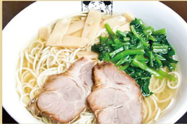
Shio Ramen (Salt Flavour Soup) $10.50 塩らーめん Noodles in chicken flavoured soup