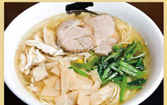
Chicken & Chashu-Men $14.00 チキン&チャーシューメン Shio Ramen with BBQ pork and shredded chicken