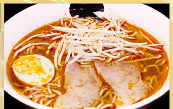
Spicy Pork Ramen $13.00 辛口らーめん Spicy Ramen with Pork