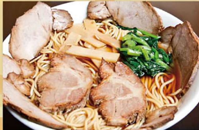
Chashu-Men $15.00 チャーシューめん Ramen with BBQ pork