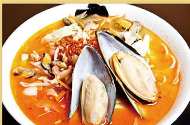
Hot Seafood Ramen $15.50 ホットシーフード Seafood Ramen in spicy soup