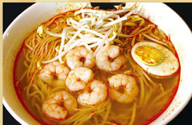
Chilli Garlic Prawn Ramen $14.00 辛口海老らーめん Spicy Shio Ramen with prawn and boiled egg