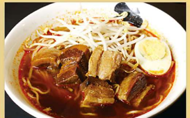
Spicy Pork Belly Ramen $15.00 辛口角煮らーめん Spicy Ramen with pork belly and boiled egg