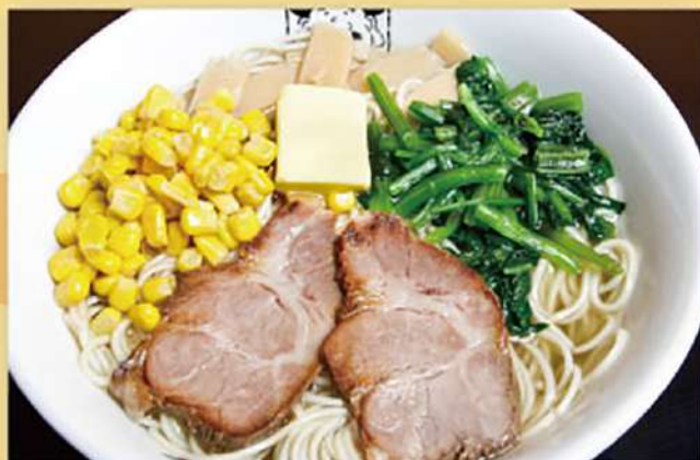
Shio Butter Corn Ramen $12.00 塩バターコーンらーめん Shio Ramen with butter and corn