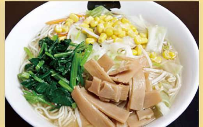
Vegetable Ramen $11.00 野菜らーめん Shio Ramen with boiled vege