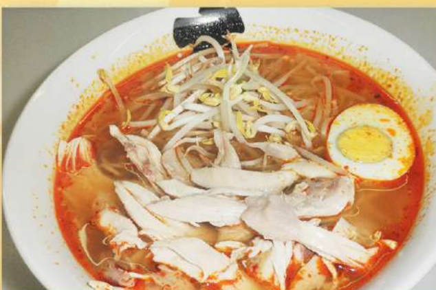
Spicy Chicken Ramen $14.00 辛口チキンラーメン Spicy Shio Ramen with shredded chicken