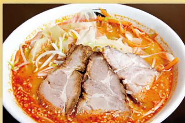
Hot Energy Ramen $14.50 スタミナらーめん Spicy Miso Ramen with BBQ pork and vegetables