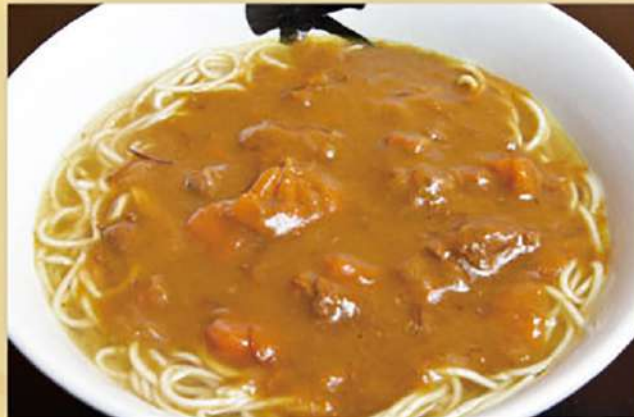
Curry Ramen $11.00 カレーらーめん Shio Ramen with beef curry sauce on top