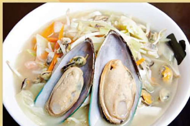
Seafood Ramen $15.00 シーフードらーめん Shio Ramen with vegetables and seafoods