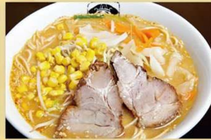
Miso Ramen (Miso Flavour Soup) $14.00 味噌らーめん Noodles with vege in miso flavoured soup