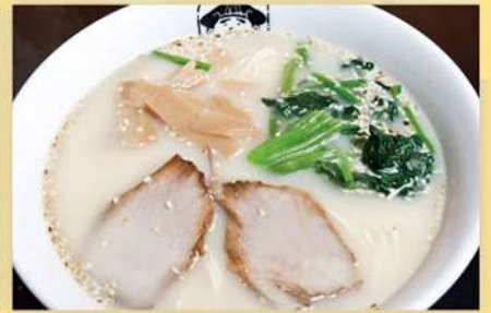
Tonkotsu Ramen (Pork Flavour Soup) $14.00 豚骨らーめん Noodles in pork flavoured soup