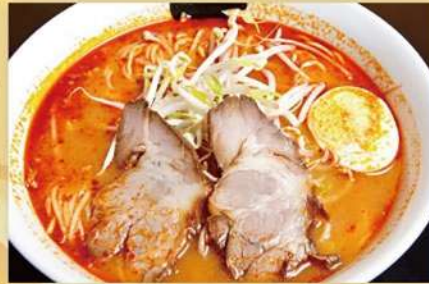
Spicy Miso Tonkotsu $17.00 辛口味噌豚骨らーめん Miso Ramen in spicy tonkotsu soup