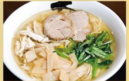
Chicken & Chashu-Men $17.00 チキン&チャーシューメン Shio Ramen with BBQ pork and shredded chicken