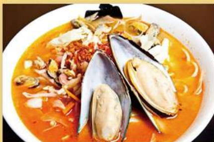
Hot Seafood Ramen $17.50 ホットシーフード Seafood Ramen in spicy soup