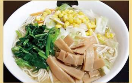
Vegetable Ramen $14.00 野菜らーめん Shio Ramen with boiled vege