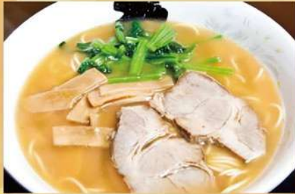
Tonkotsu-Shoyu Ramen $14.00 豚骨醤油らーめん Noodles in pork soy sauce flavoured soup