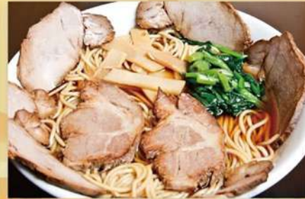
Chashu-Men $17.00 チャーシューめん Ramen with BBQ pork