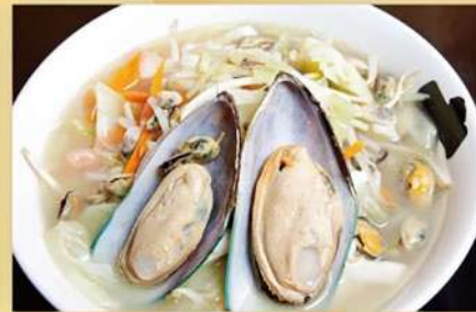
Seafood Ramen $17.00 シーフードらーめん Shio Ramen with vegetables and seafoods