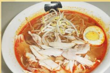
Spicy Chicken Ramen $16.00 辛口チキンラーメン Spicy Shio Ramen with shredded chicken