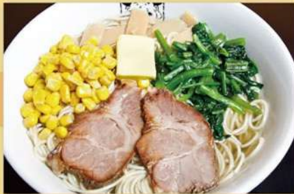
Shio Butter Corn Ramen $15.00 塩バターコーンらーめん Shio Ramen with butter and corn