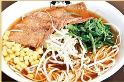
Inari Ramen $15.00 イナリらーめん Ramen with Inari (sweetened deep fried tofu)