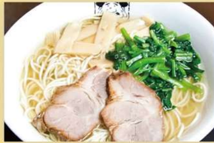
Shio Ramen (Salt Flavour Soup) $13.50 塩らーめん Noodles in chicken flavoured soup