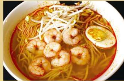
Chilli Garlic Prawn Ramen $17.00 辛口海老らーめん Spicy Shio Ramen with prawn and boiled egg