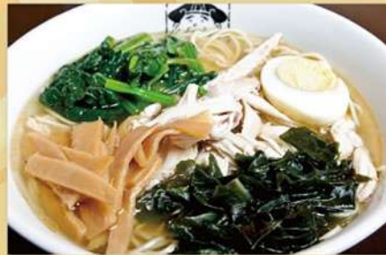
Chicken Ramen $16.00 チキンらーめん Shio Ramen with shredded chicken