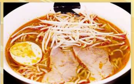
Spicy Pork Ramen $15.00 辛口らーめん Spicy Ramen with Pork