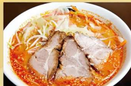
Hot Energy Ramen $16.50 スタミナらーめん Spicy Miso Ramen with BBQ pork and vegetables