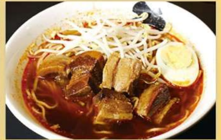
Spicy Pork Belly Ramen $18.00 辛口角煮らーめん Spicy Ramen with pork belly and boiled egg