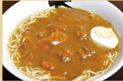
Curry Ramen $15.00 カレーらーめん Shio Ramen with beef curry sauce on top