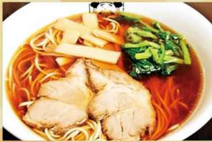
Ramen (Soy Sauce Flavour Soup) $13.50 醤油らーめん Noodles in soy sauce flavoured soup