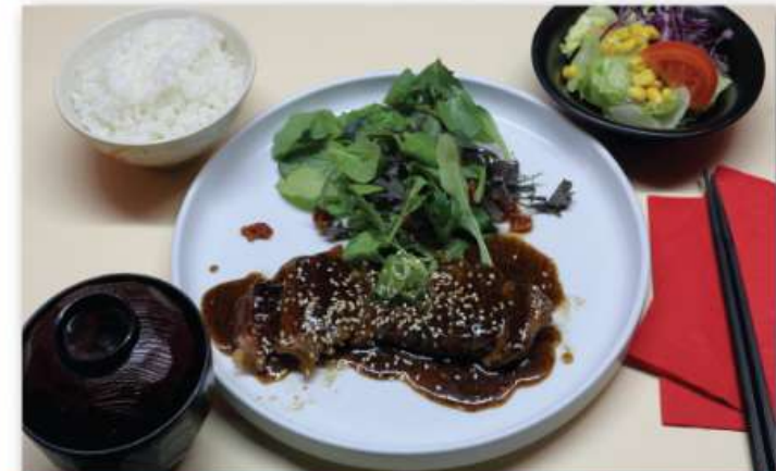
Black Pepper Beef Set Salad, Rice, Miso Soup $20.00