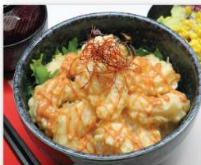
EBI-MAYO Don (Battered Prawn) $19.50