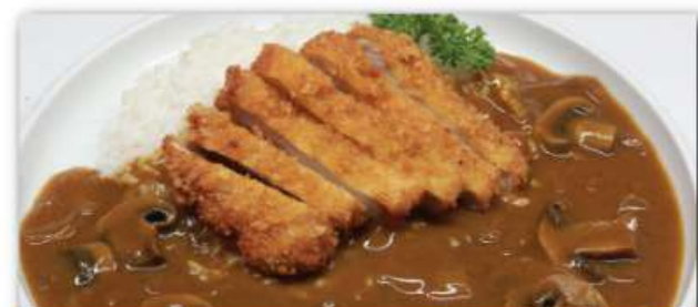
Pork Katsu Curry $19.00