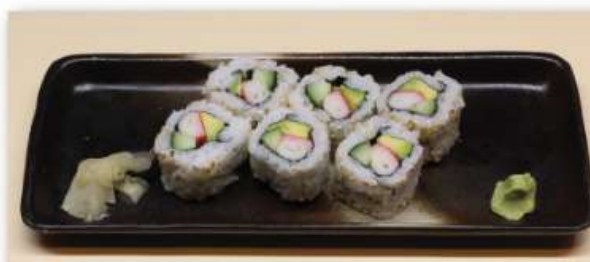
California Roll $10.00