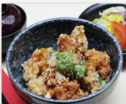
Karaage Don (Deep Fried Chicken) $17.50