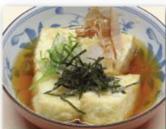
Deep Fried Tofu $9.50