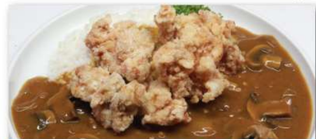
Karaage Curry $19.00