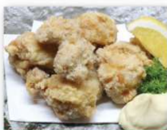
Karaage (Deep Fried Chicken) $9.50