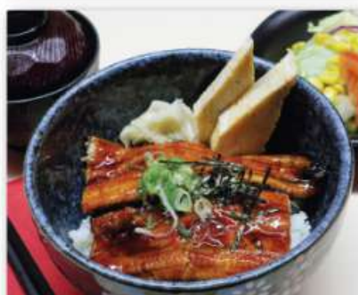
Grilled Eel Don $25.00