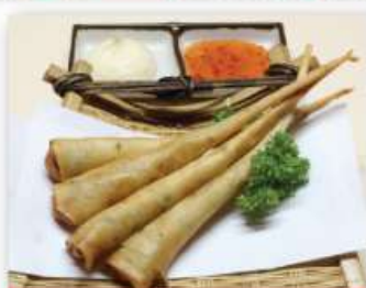
Prawn Twister 4pcs $10.00