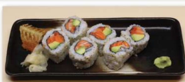
Salmon Avocado Roll $10.00