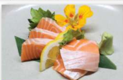
Salmon Sashimi 5pcs $11.00