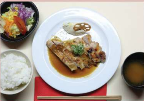
Teriyaki Lunch Set Main Dish*, Salad, Rice, Miso Soup $19.00