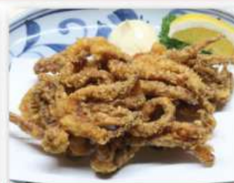
Deep Fried Squid $13.50