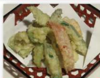
Vegetable Tempura $15.00