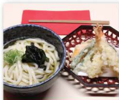
Prawn Tempura Udon $17.50