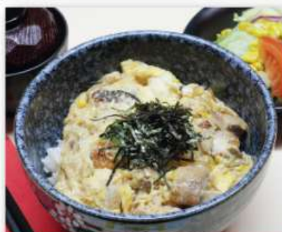
Oyako Don (Chicken & Egg) $17.50