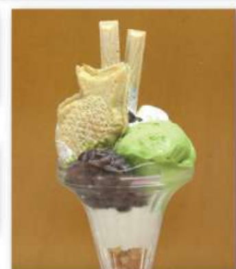
Matcha Parfait $10.00