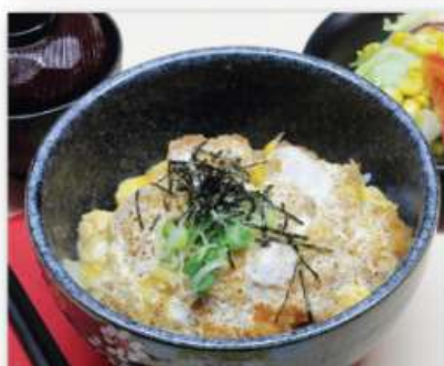
Katsu Don (Pork Cutlet & Egg) $17.50