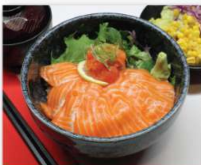
Fresh Salmon Don $22.00

Donburi + Served with Miso Soup and Salad