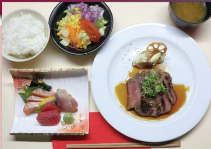
Sashimi Set Main Dish*, Sashimi, Salad, Rice, Miso Soup $27.00