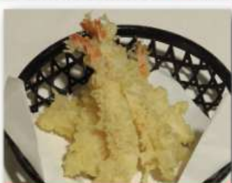
Prawn Tempura 5pcs $19.00