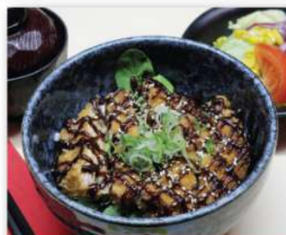
Miso Katsu Don (Pork Cutlet with Miso Sauce) $17.50