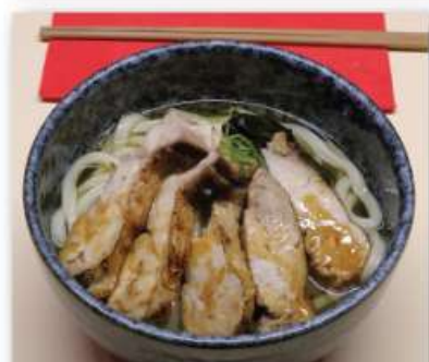
Teriyaki Chicken Udon $17.50