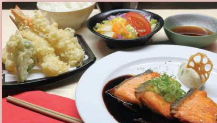
Tempura Set Main Dish*, Tempura, Salad, Rice, Miso Soup $27.00