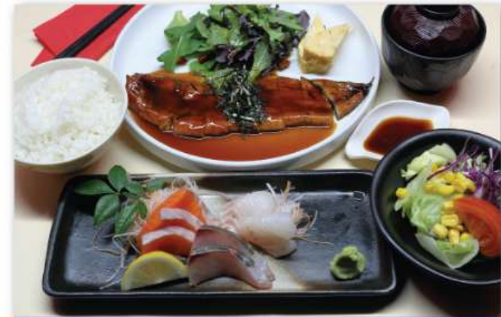
Grilled Eel & Sashimi Set Salad, Rice, Miso Soup $36.00