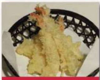
Prawn Tempura 4pcs $22.00