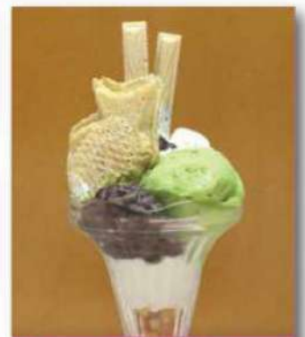
Matcha Parfait $12.50