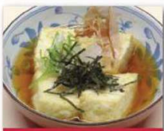
Deep Fried Tofu $14.00