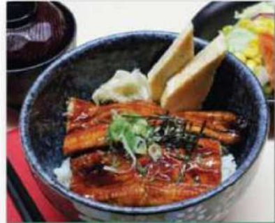
Grilled Eel Don $35.00