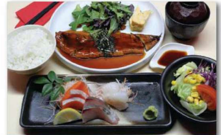
Grilled Eel & Sashimi Set Salad, Rice, Miso Soup $52.00 *Main(Eel) Only $31