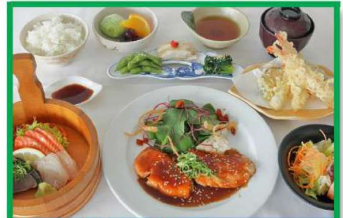
Special Dinner Set Main Dish*, Sashimi, Tempura, Salad, Rice, Miso Soup Appetizer and Ice Cream $59.00