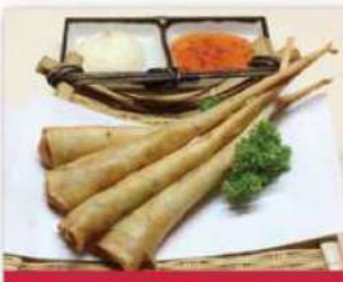
Prawn Twister 4pcs $14.00