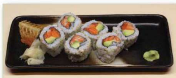
Salmon Avocado Roll $14.00