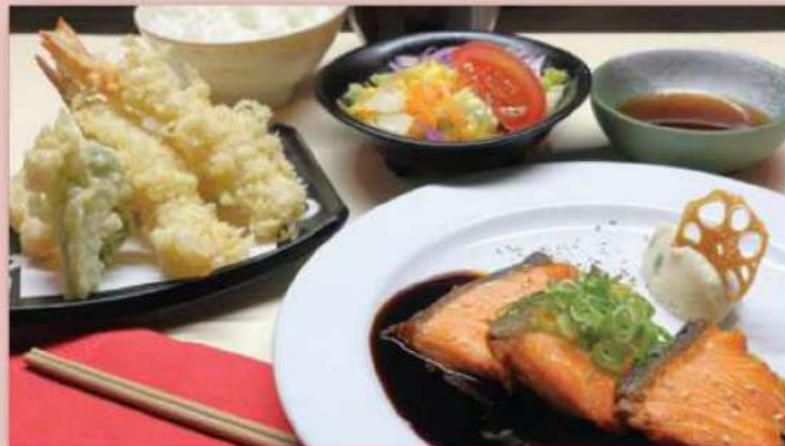
Tempura Set Main Dish*, Tempura, Salad, Rice, Miso Soup $44.00