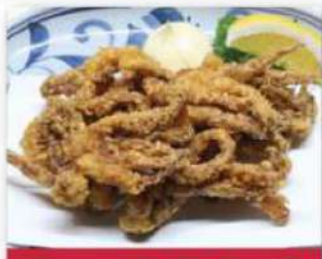
Deep Fried Squid $18.00