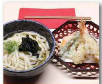
Prawn Tempura Udon $26.00