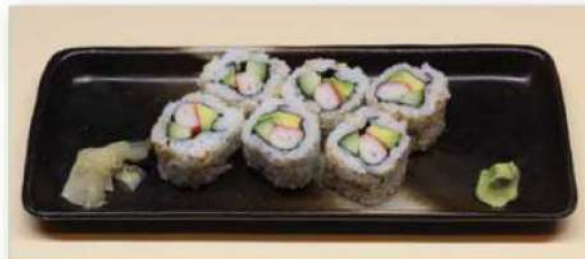
California Roll $12.00