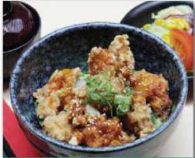
Karaage Don (Deep Fried Chicken) $27.00