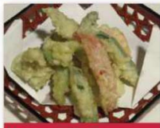
Vegetable Tempura $19.00