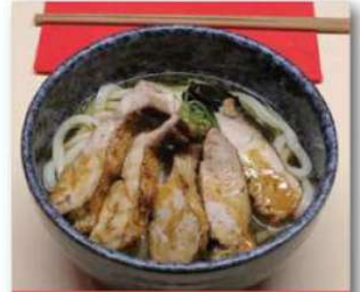
Teriyaki Chicken Udon $26.00