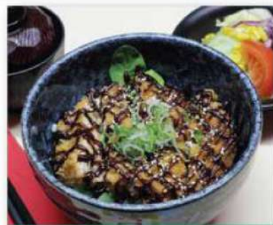
Miso Katsu Don (Pork Cutlet with Miso Sauce) $27.00