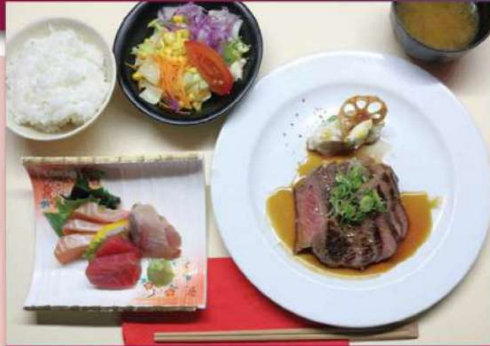
Sashimi Set Main Dish*, Sashimi, Salad, Rice, Miso Soup $44.00