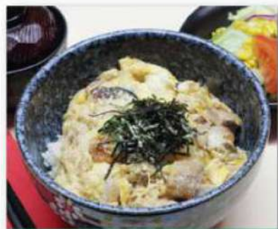
Oyako Don (Chicken & Egg) $27.00