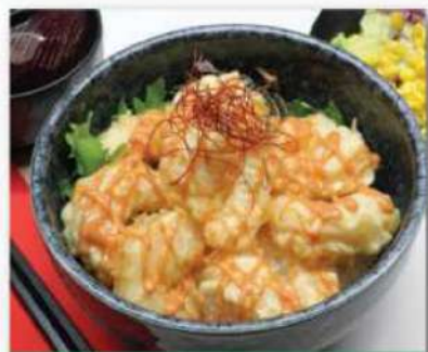
EBI-MAYO Don (Battered Prawn) $30.00