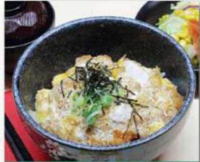
Katsu Don (Pork Cutlet & Egg) $29.00