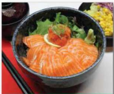
Fresh Salmon Don $32.00

Donburi + Served with Miso Soup and Mini Garden Salad