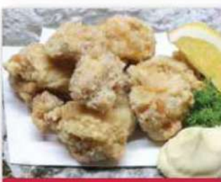
Karaage (Deep Fried Chicken) $18.00