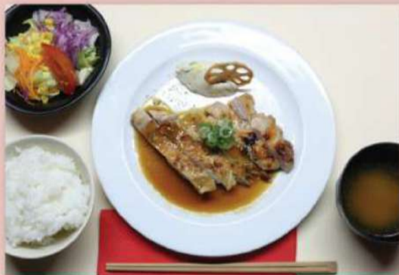
Teriyaki Lunch Set Main Dish*, Salad, Rice, Miso Soup $27.00