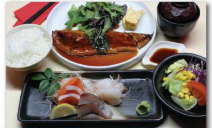
Grilled Eel & Sashimi Set Salad, Rice, Miso Soup $45.00