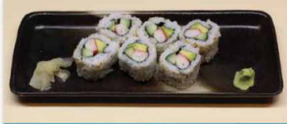
California Roll $12.00