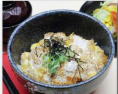
Katsu Don (Pork Cutlet & Egg) $26.00