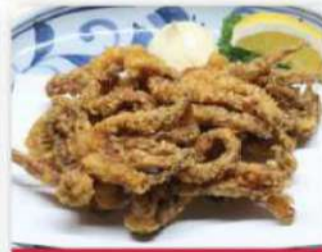
Deep Fried Squid $18.00