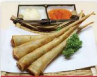
Prawn Twister 4pcs $14.00