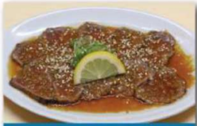
Beef Tataki Sashimi S $15 L $25