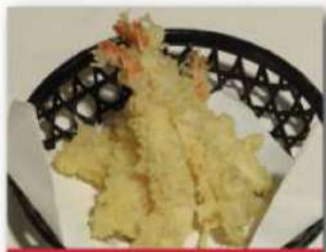
Prawn Tempura 4pcs $22.00