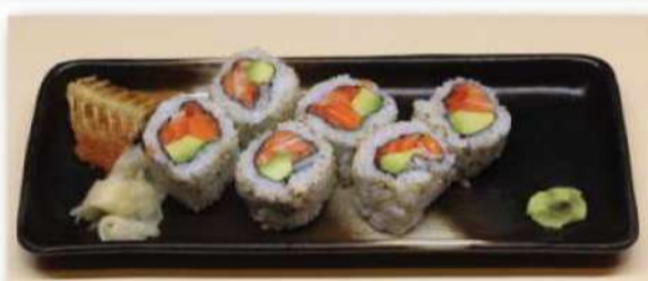
Salmon Avocado Roll $14.00