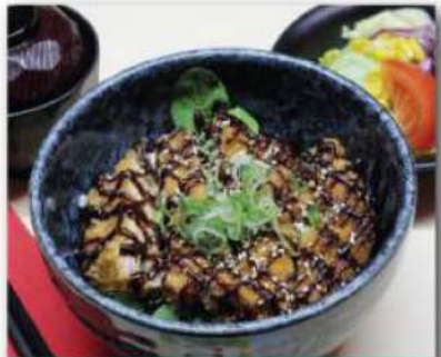
Miso Katsu Don (Pork Cutlet with Miso Sauce) $24.00