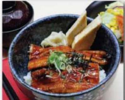
Grilled Eel Don $32.00