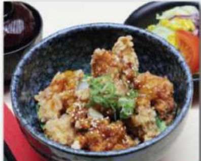
Karaage Don (Deep Fried Chicken) $24.00