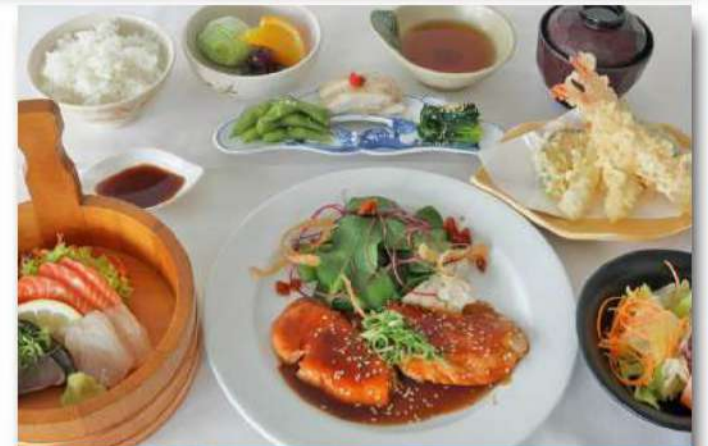
Special Lunch Set Main Dish*, Sashimi, Tempura, Salad, Rice, Miso Soup, Appetizer, Ice Cream $52.00