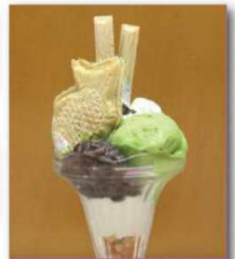
Matcha Parfait $12.50