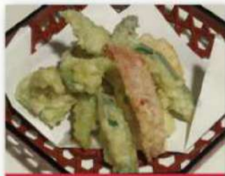
Vegetable Tempura $19.00