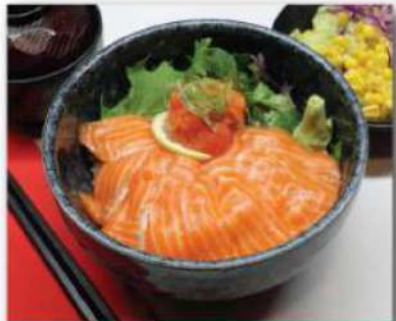
Fresh Salmon Don $29.00