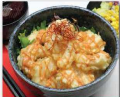
EBI-MAYO Don (Battered Prawn) $27.00