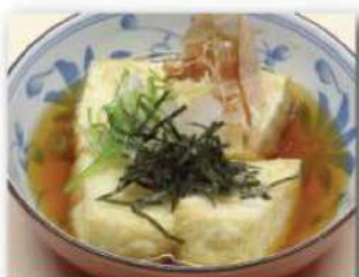
Deep Fried Tofu $14.00