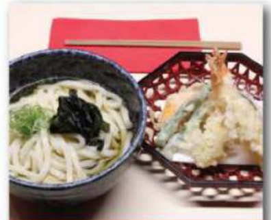
Prawn Tempura Udon $26.00