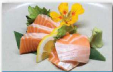
Salmon Sashimi 5pcs $16.00