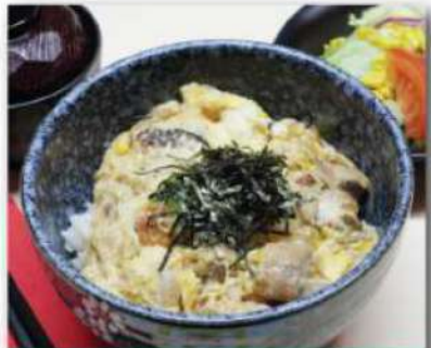
Oyako Don (Chicken & Egg) $24.00