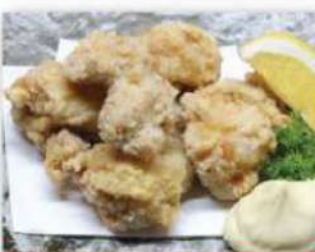
Karaage (Deep Fried Chicken) $18.00